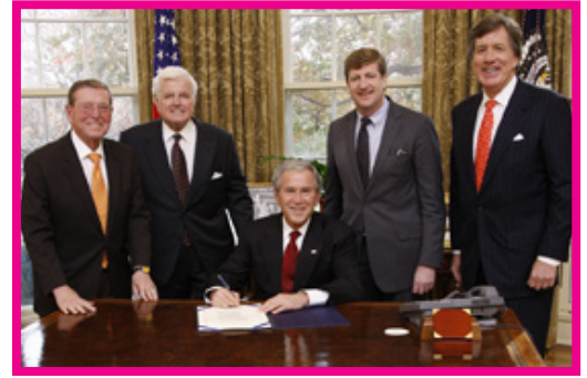
President Bush signs MHPAEA in 2008; co-sponsor Rep. Jim Ramstad (R-MN) is on the far right.

Many insurance companies were already moving toward parity, but we hear stories of insurance company representatives claiming that MHPAEA doesn't apply to them. The law applies only to insurance